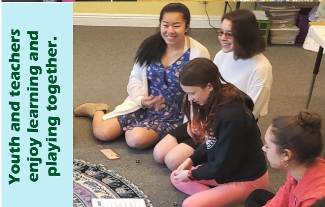
Youth and teachers enjoy learning and playing together.